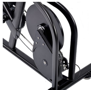
SmartIT Brake with control unit