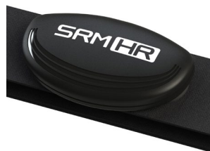
HeartRate Belt (optional)