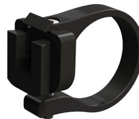
PC8 Handlebar clip (optional)