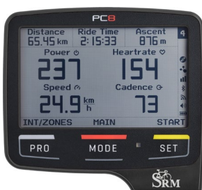
PowerControl 8 (optional)