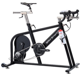
Indoor Trainer frame